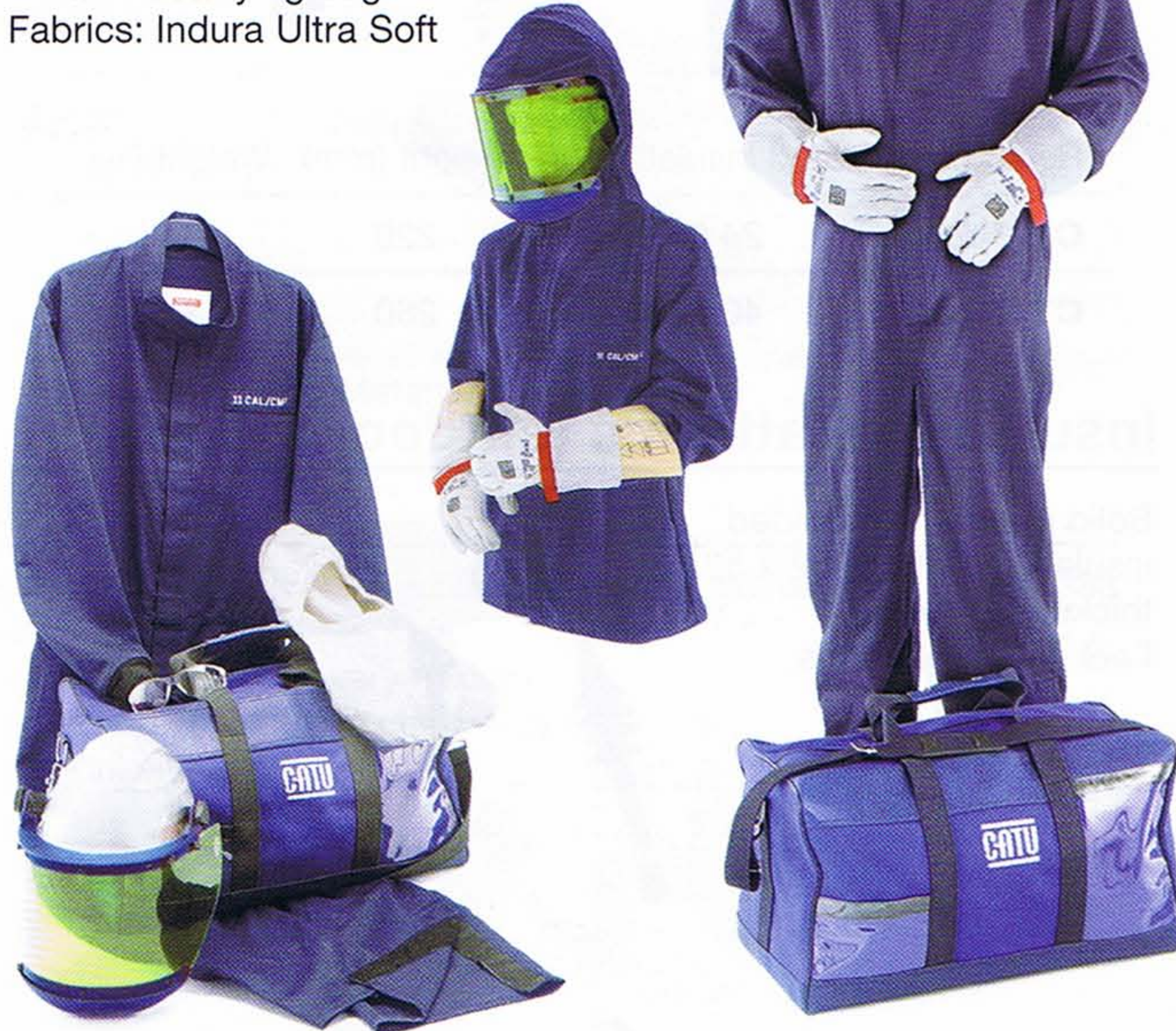
KIT-ARC-08-C* 8 cal/cm 2 with coverall Weight: 4.03 kg