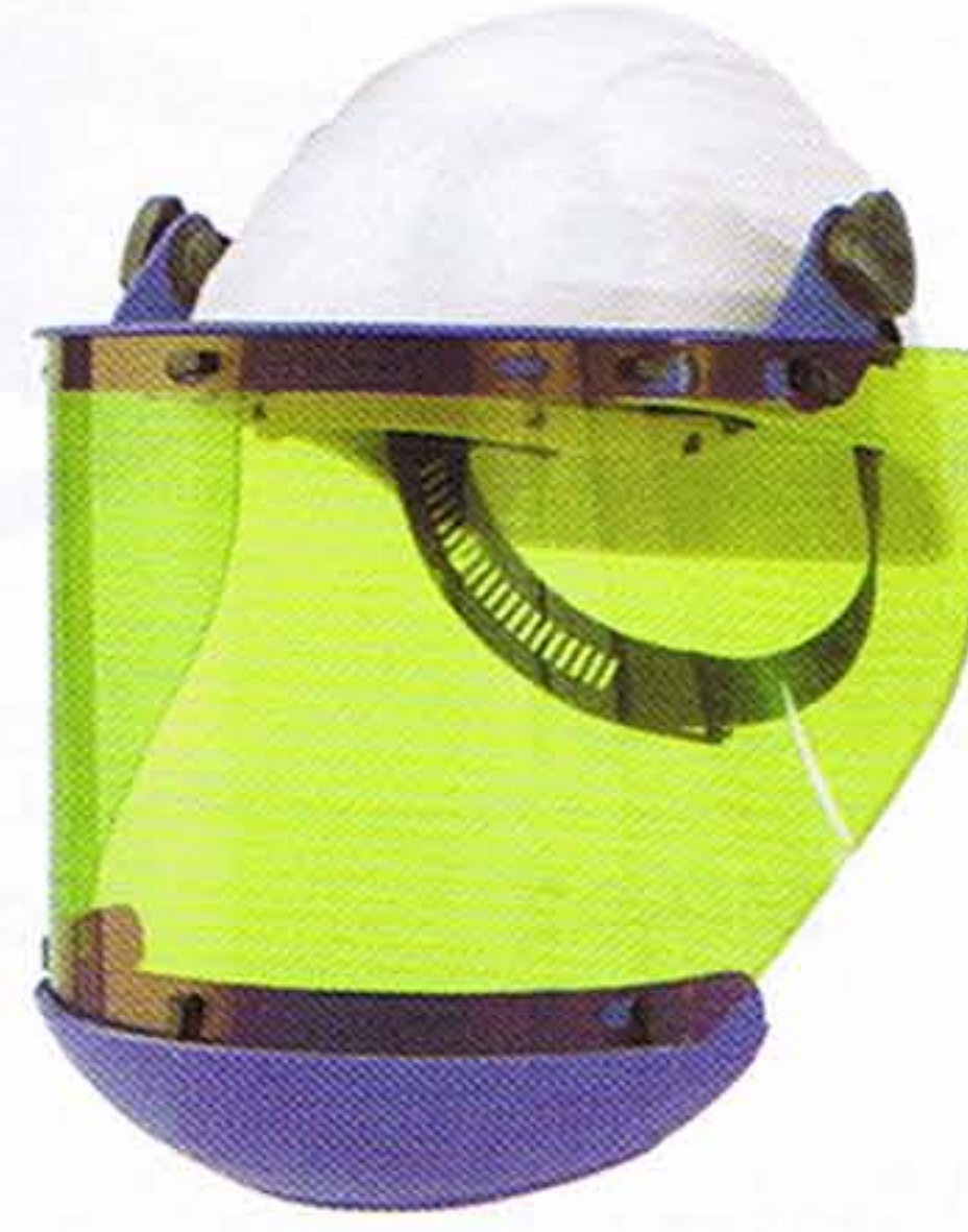
KIT-ARC-01 Weight: 1.5 kg