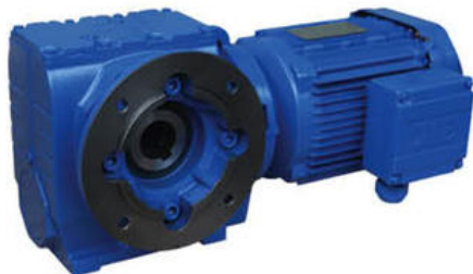
Inline Helical Gear with Input Shaft