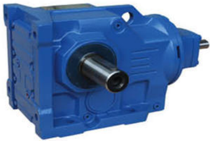
Gearbox with Input Shaft