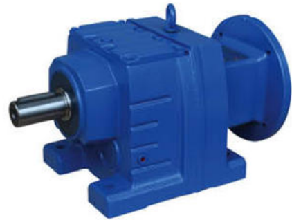
Inline Helical Gear with IEC Adaptor