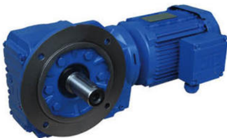
Gearbox with Solid Shaft and Flange