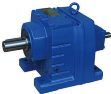
Inline Helical Gear with Input Shaft