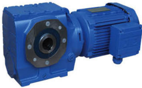
Single Reduction Gear Reducer