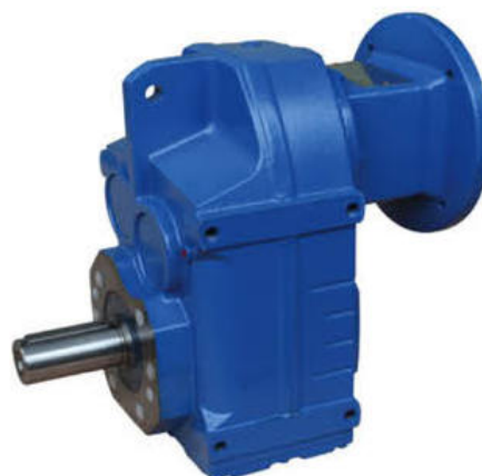
Gearbox with IEC Adaptor