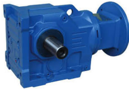
Solid Shaft Gearbox