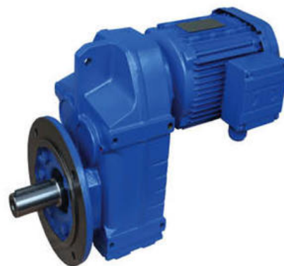
Gearbox with Solid Shaft and Flange