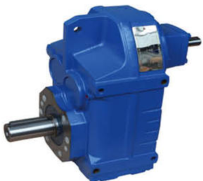
Gearbox with Input Shaft