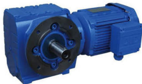
Tandem Gear Reducer