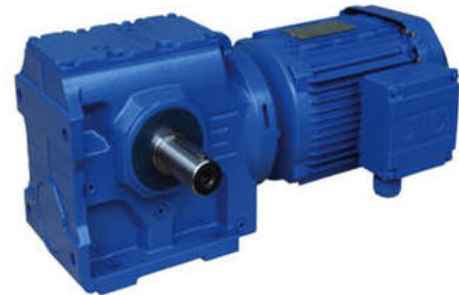
Inline Helical Gear with IEC Adaptor