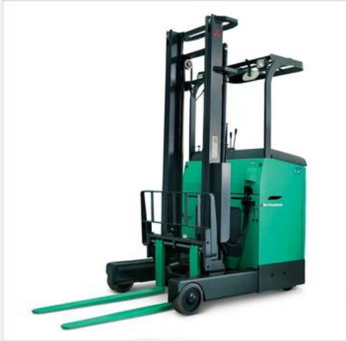
MITSUBISHI Reachtruck Battery 1.5 - 2.5 Ton