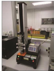
Universal Strength Tester