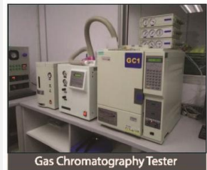
Gas Chromatography Tester