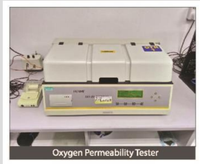
Oxygen Permeability Tester