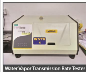
Water Vapor Transmission Rate Tester