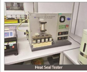
Heat Seal Tester